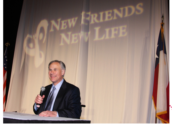
Texas Attorney General Greg Abbott speaking at the WINGS Luncheon